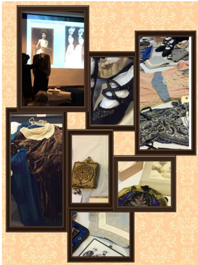
Downton Abbey Fashions