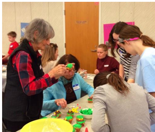
Joint Friends and Jr. Friends baking for Spring Plant & Bake Sale